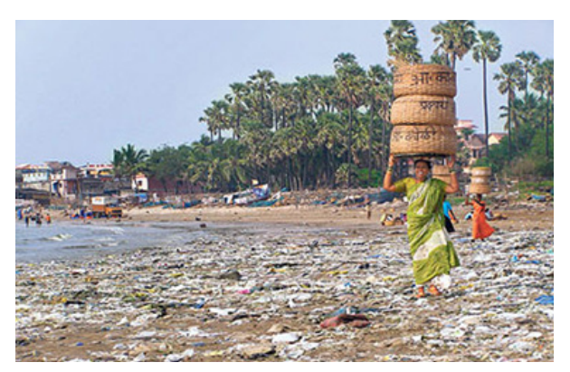
Figure 3. Waste dumping in the coastal area

followed, where 83% of waste was mismanaged, added 0.48 to 1.29 MT of marine plastic to the seas that year. The US ranked 20th, where only 2% of waste was badly handled, and 0.04 to 0.11m tonnes of plastic found its way to the ocean. Sixteen of the top 20 polluters are middle income countries where fast economic growth is not accompanied by major improvements in waste handling. The cumulative amount of plastic in the seas will soar tenfold by 2025 if nothing is done to slash waste generation or manage it more effectively. The current annual rate of 8m tonnes put into the oceans could also double by 2025 without action (The Guardian 2015). If changes are made, they could have a huge impact, the scientists claim. Reducing mismanaged plastic waste by 50% in the top 20 ranked countries would cut the pile of plastic likely to end up in the oceans by 41% in 2025. More stringent caps on plastic in waste streams, and better disposal in the top ten-ranked countries could reduce the amount of new marine plastic to 2.4 to 6.4m tonnes annually by 2025.